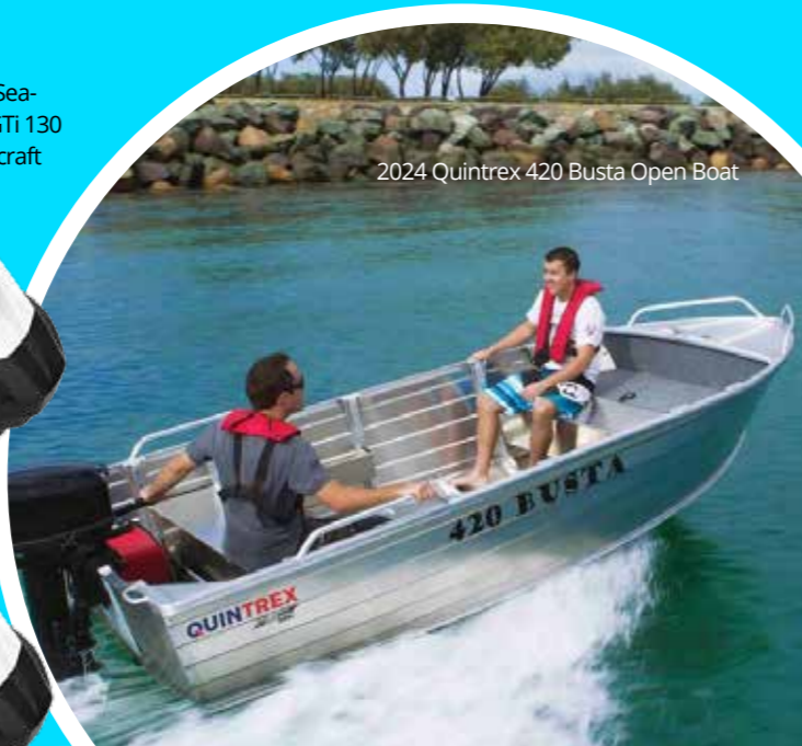
2024 Quintrex 420 Busta Open Boat