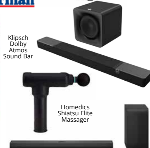
Klipsch Dolby Atmos Sound Bar