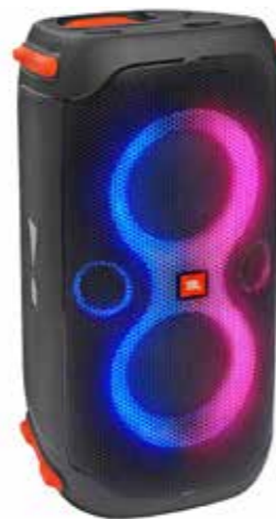
JBL Party Box 110 portable speaker