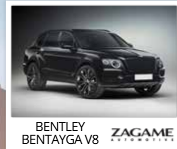
BENTLEY BENTAYGA V8 ZAGAME AUTOMOTIVE

NESTLED BETWEEN TWO OF THE WORLD'S MOST ICONIC LANDMARKS