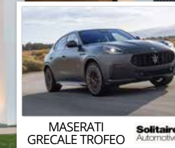
MASERATI GRECALE TROFEO Solitaire Automotive

EMBRACE THE SERENITY OF ADELAIDE'S JEWEL-LIKE FOOTHILLS