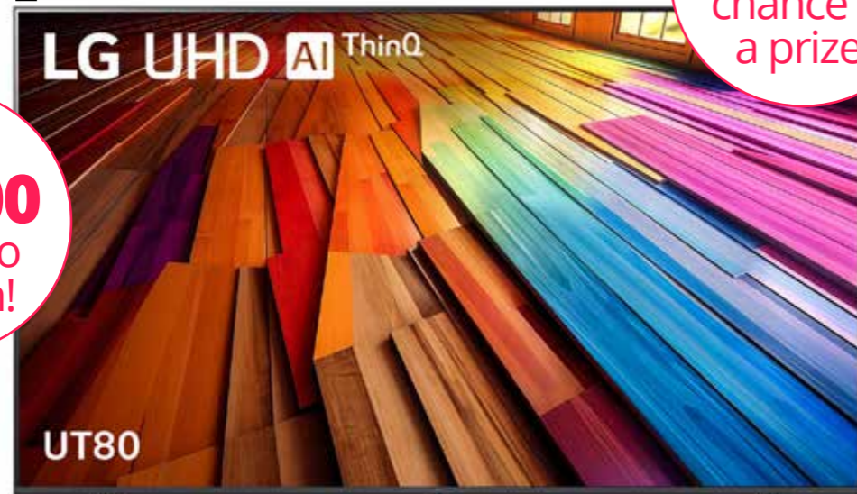
LG 4K UHD LED Smart TV