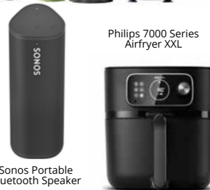
Sonos Portable Bluetooth Speaker