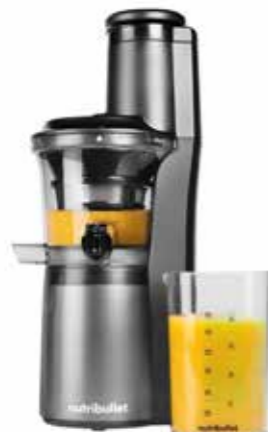
NutriBullet Slow Juicer