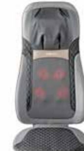
Homedics Therapist Massager