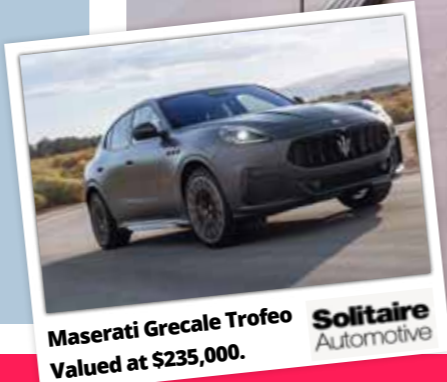
Maserati Grecale Trofeo Valued at $235,000. Solitaire Automotive

Go online for our video tour and floor plans