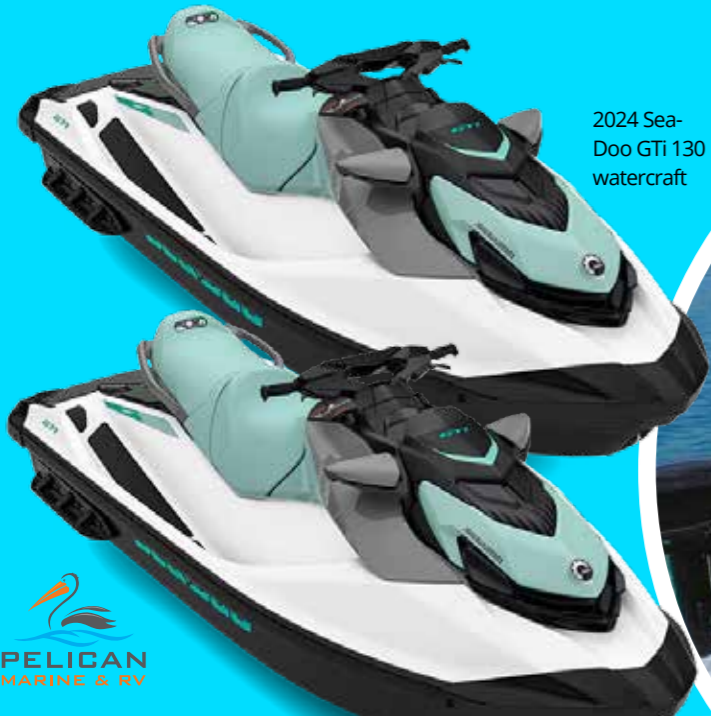
2024 Sea-Doo GTI 130 watercraft

Ticket deadline: 10.11.2024. Draw: 13.11.2024.