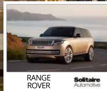
RANGE ROVER Solitaire Automotive

LEVEL UP TO THE LUXURIOUS LIFESTYLE OF YOUR DREAMS