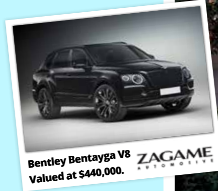
Bentley Bentayga V8 Valued at $440,000. ZAGAME AUTOMOTIVE

Win our Grand Prize and you'll be able to choose to make this two-bedroom multi-level home with two living areas, two bathrooms and floor to ceiling windows your own. For the first time in Australia, the UK's Kelly Hoppen has brought her 'opulent wealth' style to the building's shared access interiors including gymnasium, swimming pool and so much more. You really will be the envy of your friends and family with this knock-out address in the historic waterfront neighbourhood of The Rocks.