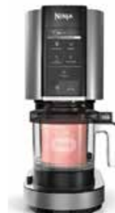
Ninja IceCream Maker