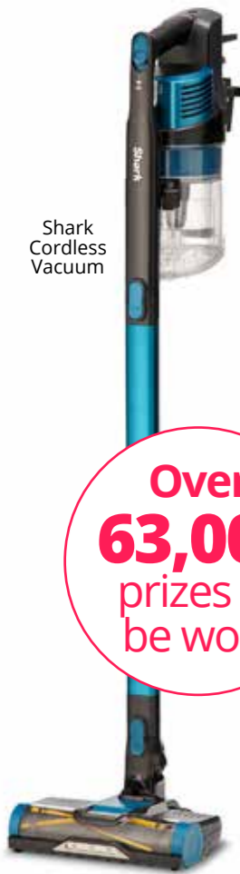
Shark Cordless Vacuum