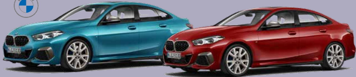
2 x BMW 220i Gran Coupe