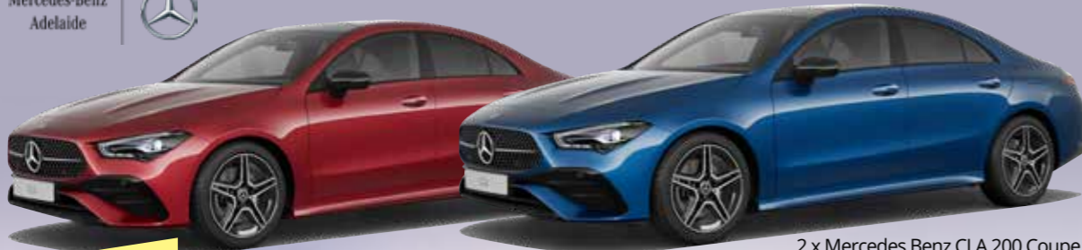
2 x Mercedes Benz CLA 200 Coupe