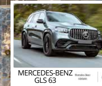
MERCEDES-BENZ GLS 63

IMAGINE LUXURY LIVING ON THE WATER'S EDGE