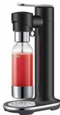
Breville The Infizz Fusion Black