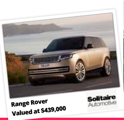
Range Rover Valued at $439,000 Solitaire Automotive

Providing lifesaving care to those in need